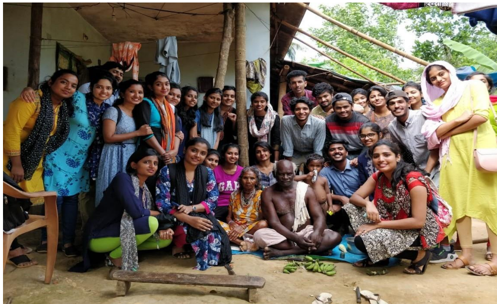
Tribal colony in Niravilpussha Students involved in preparation of Tapioca curry in traditional method