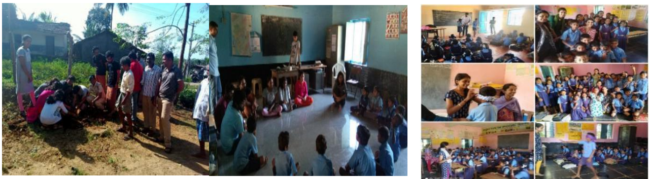
Visit to baalvadi, primary and high schools