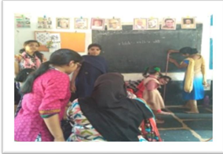
Students of FST giving talk on importance of consuming all kinds of fruits and vegetables