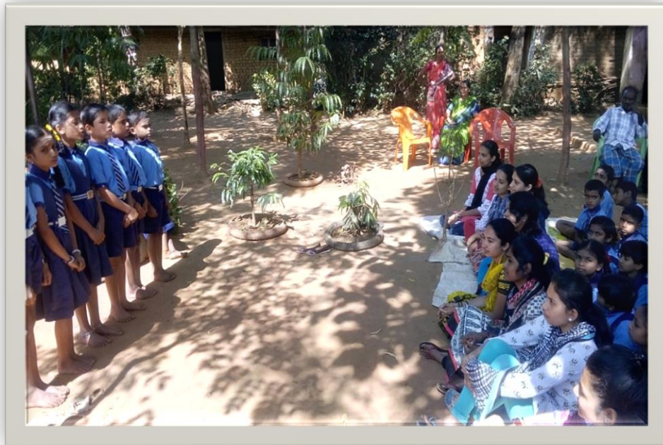
Interaction with students