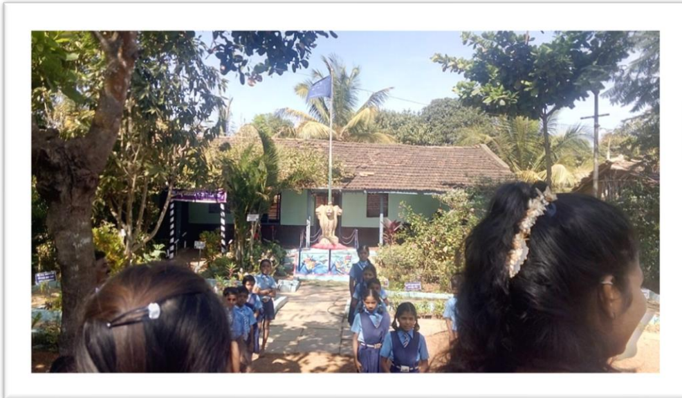
Students interacting with school children