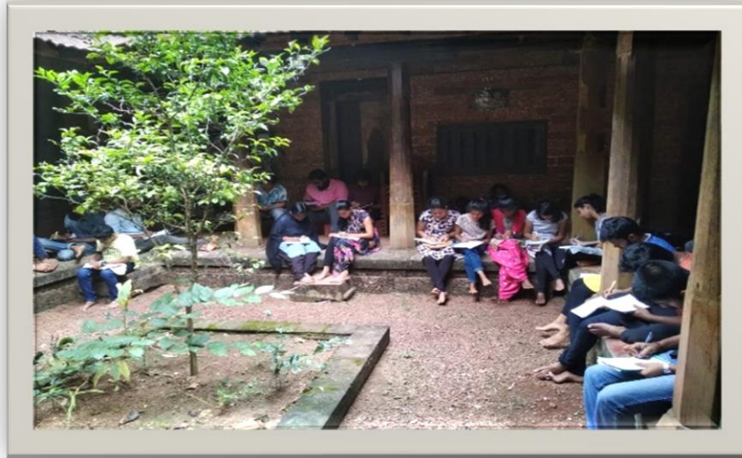
Interaction in school in Mundugod