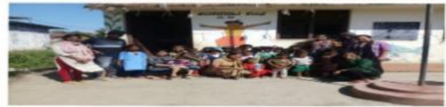
Organic farming, Shashimala