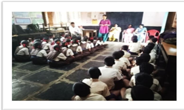
School children of Singanahalli were educated on hygiene practices such as correct method of washing hands and hygiene during sickness.