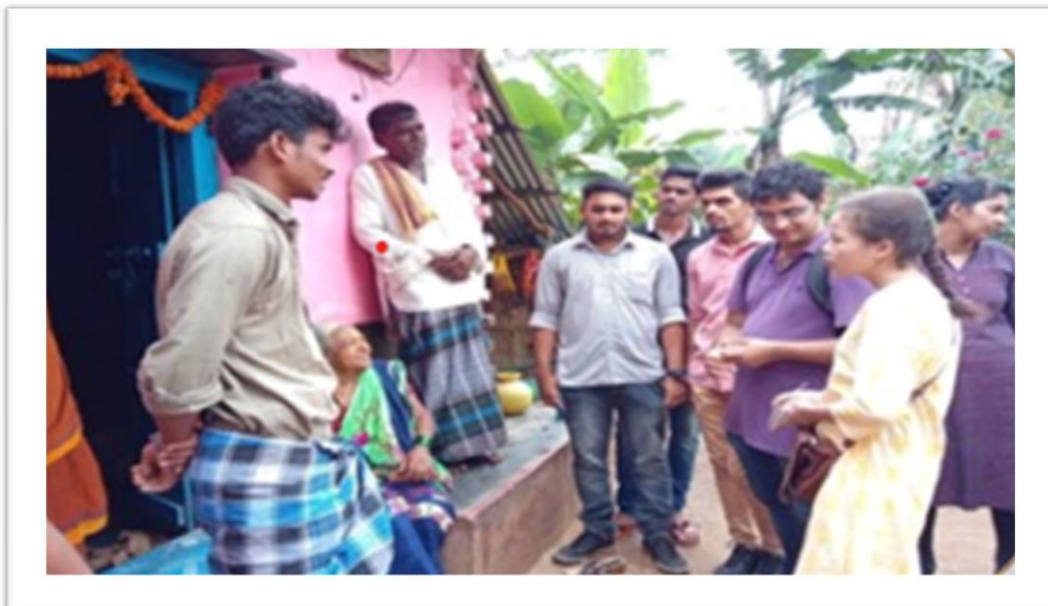
Students visiting villages home and interacting

PG department of Social Work on Students visited the houses in Mundgod and had interaction with the members of the house. Through home visit they found out the problems and needs of the village people on 2017