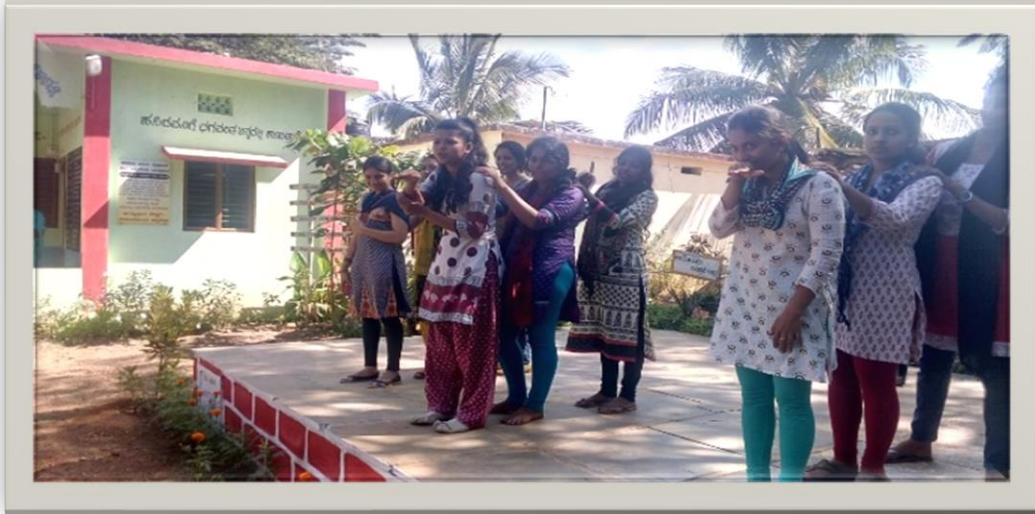
Students conducting games in school