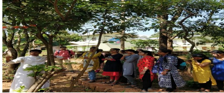
Center of Conservation of Medicinal Plants and Biodiversity