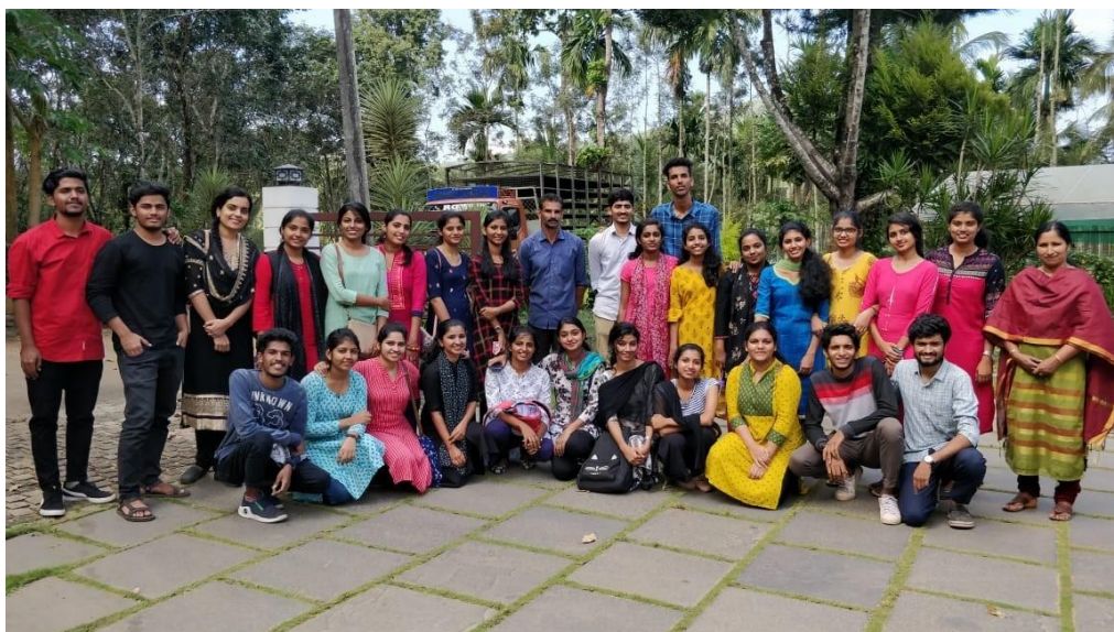
Field visit, study on struggles faced by farmers