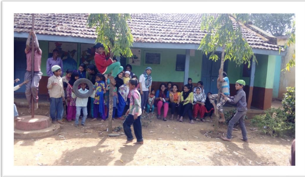
Outdoor games competition