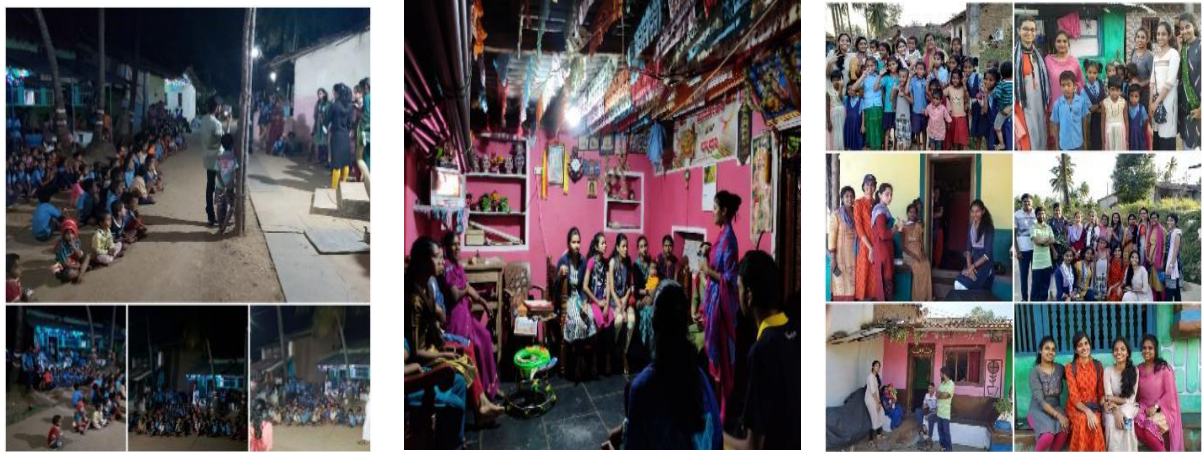
Street play regarding HIV awareness