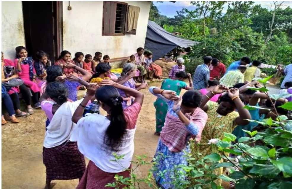
Villagers performing cultural dance